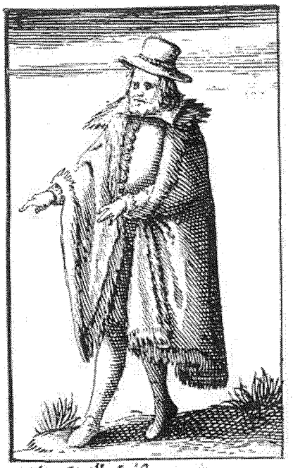
The Civill Irigh man