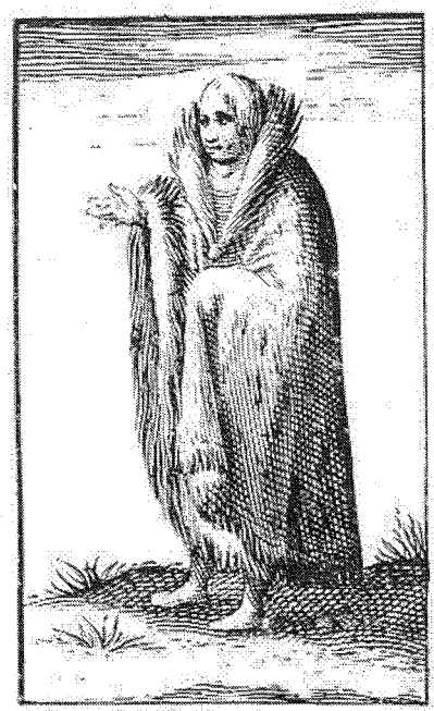
The Wilde Irifh Woman