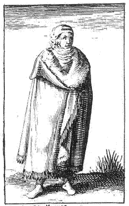
The Civill Irifh Woman