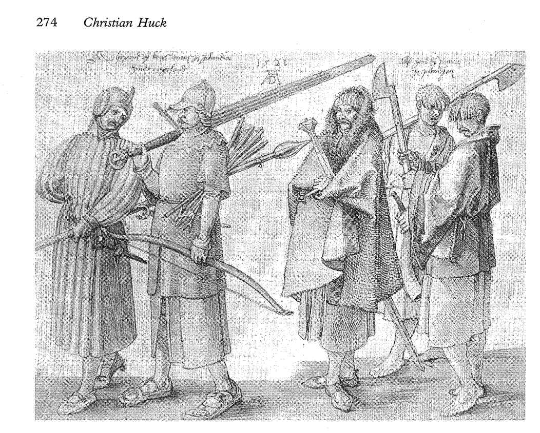
17. DRAWING BY ALBRECHT DÜRER OF IRISH SOLDIERS AND FOOR PEOPLE, (Pholograph from the National Gallery, Dublin)

FIG. 1. H. F. McClintock: Old Ireland & Highland Dress (Dundalgan Press, 1950).